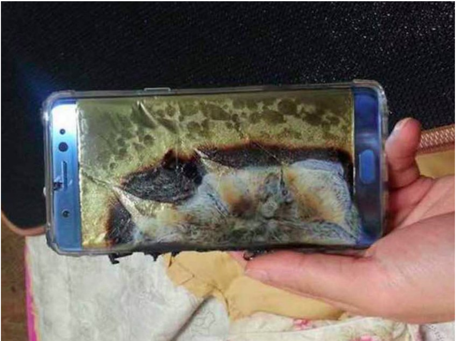
A melted Samsung Galaxy Note 7.